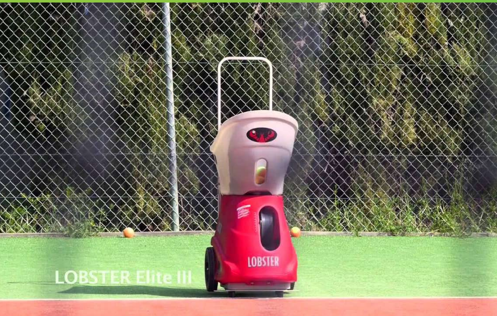
LOBSTER Elite III